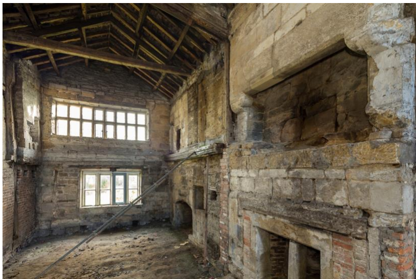
Calverley Old Hall